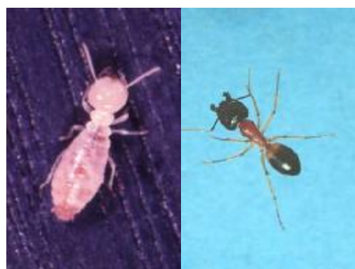
Figure 1. Worker termite and ant. Termites have straight or slightly curved, beadlike antennae, no eyes and no constriction between thorax and abdomen. Ants have markedly bent antennae, compound eyes, and a distinct 'waist'.

Termites are pallid, secretive creatures colloquially known as 'white ants'. Although termites and ants are very different types of insect, the confusion is understandable as they share some remarkable similarities. Both follow trails, live in nests or colonies in the ground, in timber and in trees and sometimes invade buildings. Nests are generally under the control of a single queen, and other members of the colony can have a range of specialised forms. Despite the similarities, termites differ from ants in a number of important ways (Figure 1). One major difference is that termites almost always remain hidden from view. Another is embodied in the name Isoptera, the insect group termites belong to. Isoptera (from the Greek Isos meaning the same, and ptera meaning wings) describes the paired wings of the reproductive caste, which are of equal size. In contrast the forewing of an ant is usually larger than the hind wing.